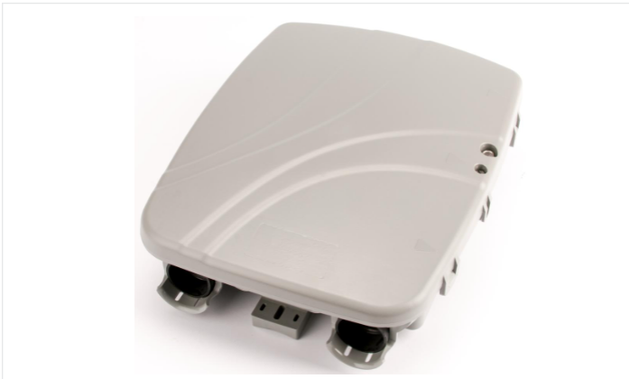
LPT Terminal Front Cover