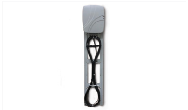
LPT Mounting Bracket

Indoor/outdoor protective skirt kit allows the removal and installation of the skirt without the use of tools after initial installation. The cavity created by the skirt along with the features on the mounting bracket, allow both cable management and storage for the incoming and drop cables.