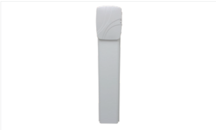
LPT Indoor/Outdoor Skirt