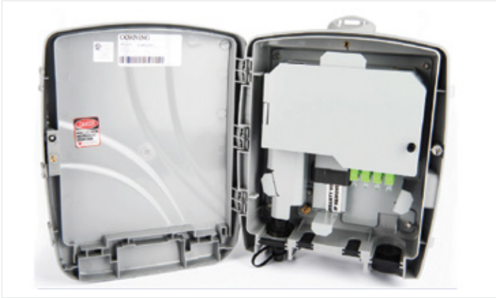
LPT Terminal with OptiTap® Adapter Feeder Input