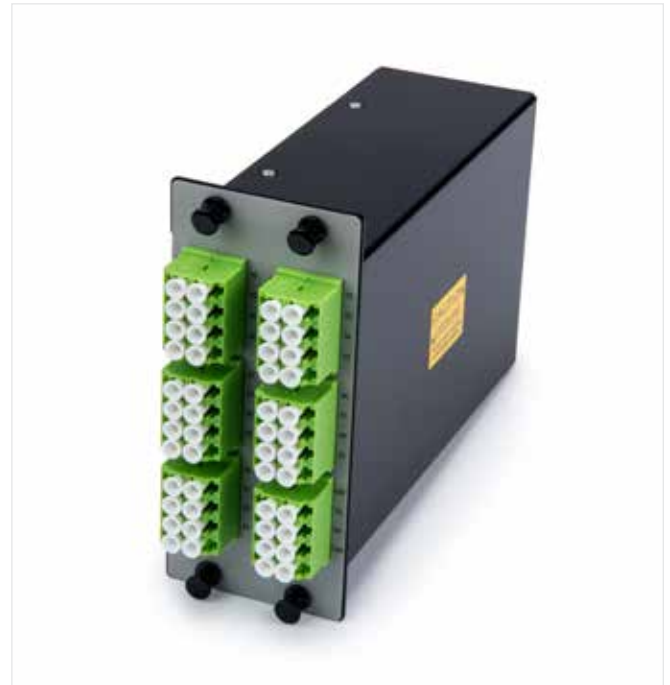
Part Number: DKXB31A402000ZZB50

Corning offers a variety of DWDM modules compatible with the LDC family connector housings. Components are compliant to Telcordia requirements, including GR-1209, GR-1221, and others as appropriate to the specification. The modules are routed directly to the LDC family housing.