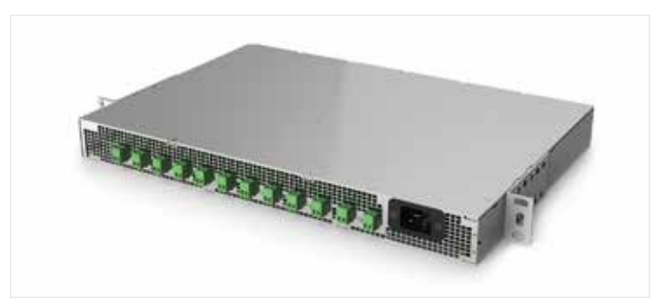
Power Supply Unit (PSU6-1U)