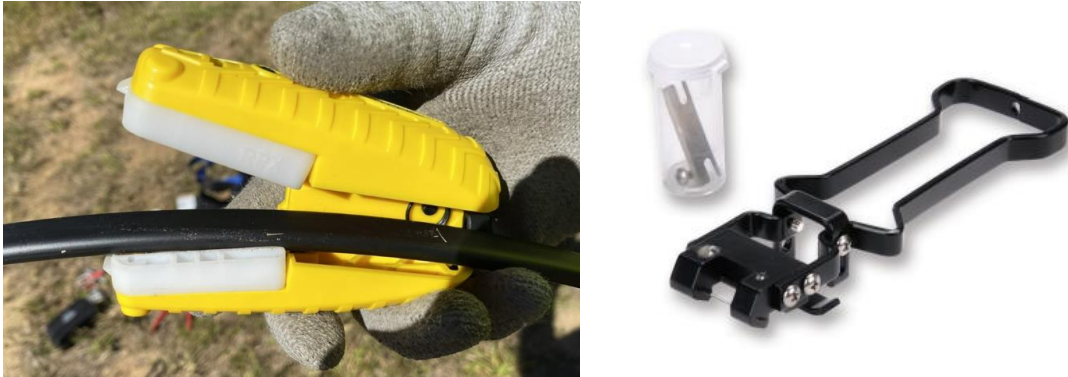
Figure 4. Ripley MB02 (left) and Corning RPX2-CAT (right)

RPX cable can be accessed using either the Corning RPX cable access tool or the Ripley MB02 Cable splitter with RPX tray inserts (Figure 4). Sheath access of RPX cable is described in more detail in SRP 004-115 .