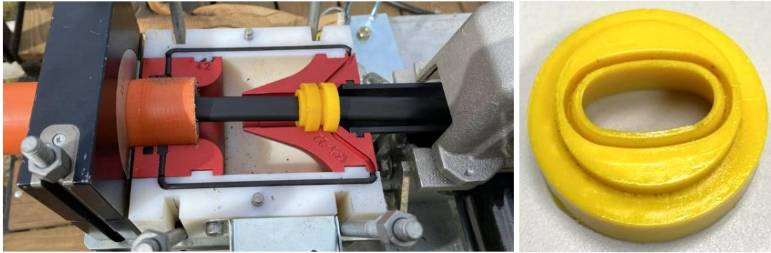
Figure 2. Plummetaz SuperJet RPX Cable Seals

Contact the jetting/blowing machine manufacturer for more information on availability of RPX seals.