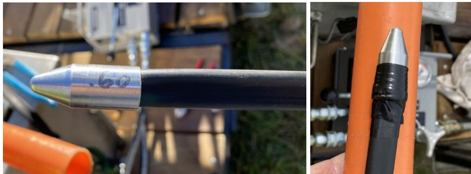
Figure 3. Bullet on RPX Cable

Corning Optical Communications has conducted field trials confirming the blowing capability of RPX cable and achieved distances over 3500 feet. All sizes of RPX cable were installed in both 1-inch and 1.25-inch diameter duct, passing through multiple bends and looped couplings in vaults. Findings of the field trial were that simultaneous gradual application of air pressure and mechanical drive leads to greater installation speeds and distances. The blowing process is the same of that with round cables, however insertion of air earlier in the process is recommended to make a smooth vibration free installation. A cable bullet should be installed on the end of the cable. Bullets used for traditional round cables are acceptable with taping and shaping the end of the cable as needed. (Figure 3)