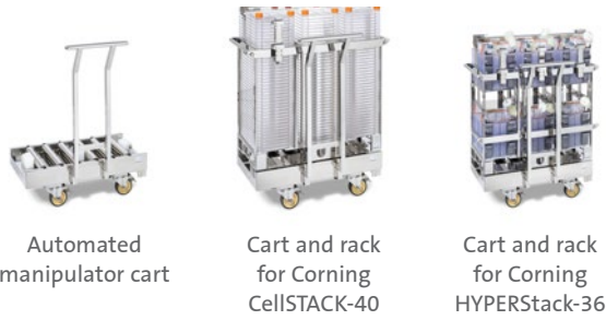
Automated manipulator cart